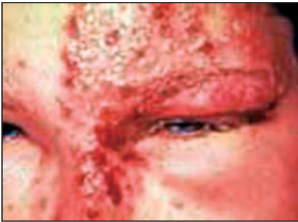
Fig. 1 Herpes zoster ophthalmicus, V1.