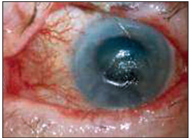
Fig. 4 Neurotrophic keratitis with melt.

tissues. 10 Early corneal findings include punctate epithelial keratitis, pseudodendrites (Fig. 2), and anterior stromal infiltrates (Fig. 3). 10 Later findings include mucous plaques, disciform keratitis, neurotrophic keratitis (Fig. 4), and exposure keratitis. 10 Corneal scarring after infection is common and can range from faint stromal haze to an opaque region with associated thinning. 10 Less commonly, corneal ulcers and perforations can develop. 10